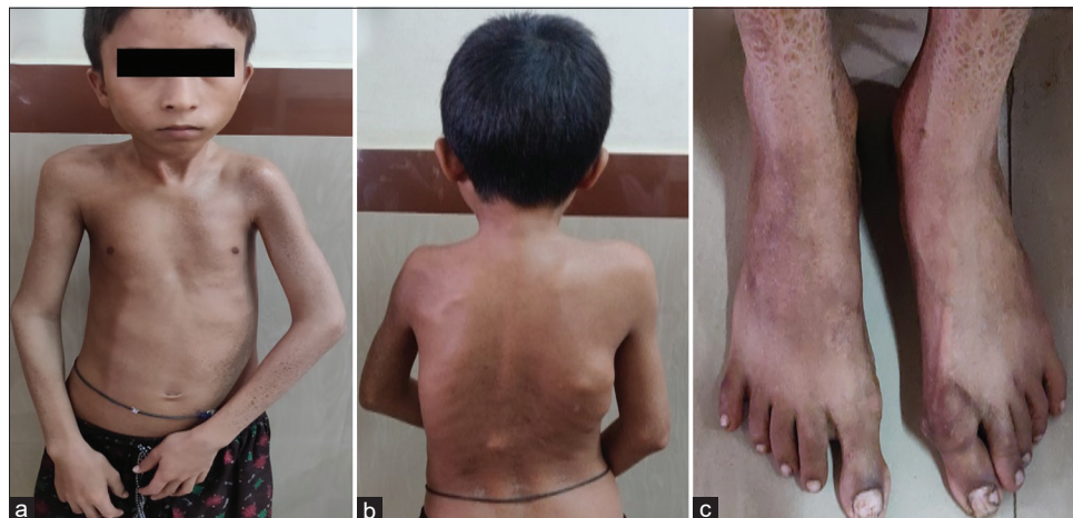
Figure 1: (a) Clinical photograph of the child showing flexion at bilateral elbow joints. (b) Scoliosis of the dorsolumbar spine with swelling over the midline and left scapula. (c) Hallux valgus deformity in the left foot.

The pathogenesis of FOP is dysregulated bone morphogenetic protein (BMP) signaling. Classic FOP is caused by a single common heterozygous mutation (617G>A; R206H) identified in the cytoplasmic domain of ACVR1/activin-like kinase 2, a BMP type I receptor, in five small multigenerational families and all sporadically affected individuals. [2] Evidence suggests that the involvement of the inflammatory component of the immune system plays a critical role in FOP. [7] The presence of macrophages, lymphocytes, and mast cells in the early FOP lesions, macrophage and lymphocyte-associated death