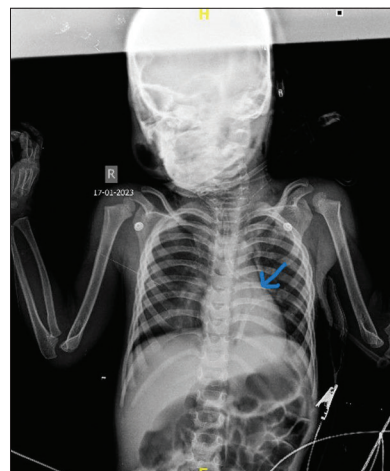
Figure 1: X-ray showing broken tracheostomy tube in the left main bronchus (Blue arrow).

On admission, the child was supported by bag and tube ventilation while maintaining satisfactory saturation with 5L O 2 through T piece. Subsequently, subcutaneous emphysema was observed on the left chest wall along with pneumothorax. A chest X-ray revealed a broken tracheostomy tube in the left main bronchus area [Figure 1], prompting an ENT consultation for foreign body removal. Under general anaesthesia, the skin stoma was revised, enabling visualisation of the tracheostomy tube. Using optical forceps and a telescope introduced through the tracheostomy, the broken tube in the left bronchus was successfully extracted and replaced with a size 4 cuffed tracheostomy tube [Figure 2]. Haemostasis was achieved, and the child