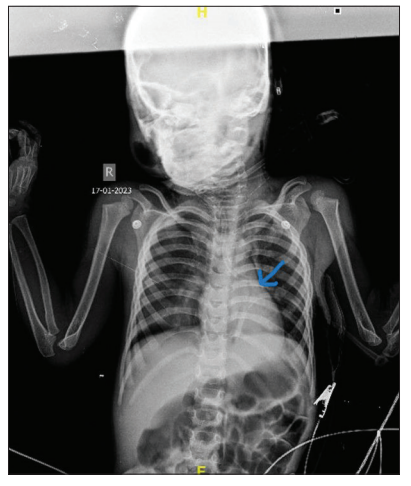
Figure 1: X-ray showing broken tracheostomy tube in the left main bronchus (Blue arrow).

On admission, the child was supported by bag and tube ventilation while maintaining satisfactory saturation with 5L O2 through T piece. Subsequently, subcutaneous emphysema was observed on the left chest wall along with pneumothorax. A chest X-ray revealed a broken tracheostomy tube in the left main bronchus area [Figure 1], prompting an ENT consultation for foreign body removal. Under general anaesthesia, the skin stoma was revised, enabling visualisation of the tracheostomy tube. Using optical forceps and a telescope introduced through the tracheostomy, the broken tube in the left bronchus was successfully extracted and replaced with a size 4 cuffed tracheostomy tube [Figure 2]. Haemostasis was achieved, and the child