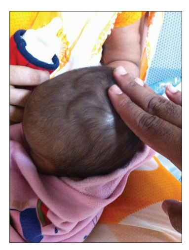
Figure 3: Scalp swelling in case 2.