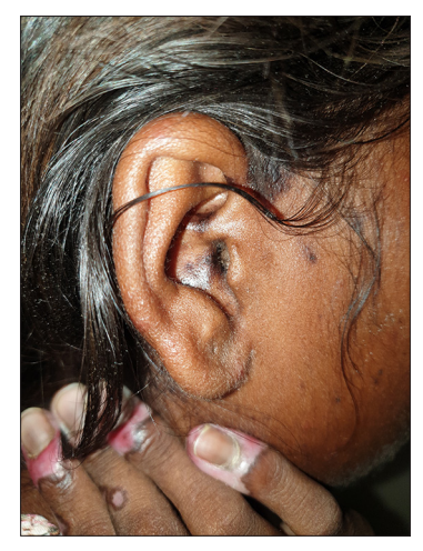
Figure 2: Hyperpigmented plaque with follicular plugging involving the concha of the ear.

lower than that of SLE.[11] Pathogenesis of this disease is multi factorial and involves an interplay of various host and environmental factors. In genetically predisposed individuals, environmental factors such as ultraviolet radiation, certain drugs, and infections can cause cell damage, thereby activating the immune response. Autoantibodies and immune complexes are formed and deposited as a result of an inflammatory cascade of cytokine activation, specifically the type I and type II interferons.[12] Comprehensive research has been done on the role of viral infections, such as cytomegalovirus, hepatitis A, and coronaviruses, in initiating or aggravating autoimmune disorders. Molecular mimicry, bystander inflammation, epitope spreading, and the exposure of cryptic antigens are some of the potential mechanisms at play. [13]