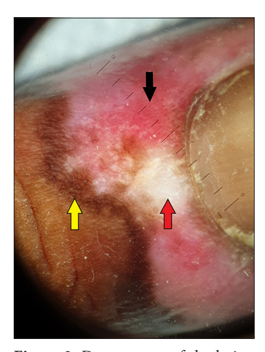
Figure 3: Dermoscopy of the lesion on the right hand showing cicatricial milky red areas (black arrows), structureless white patches (red arrow) and a peripheral pigmented network (yellow arrow) (Heine Delta 20T dermatoscope, non-polarised contact mode, ×10).

it is noteworthy that in certain cases, these disorders are triggered or exacerbated by the vaccine itself. Covishield is a viral vector vaccine that uses an attenuated, nonreplicating strain of chimpanzee adenovirus as a vector to carry the spike glycoprotein of SARS-CoV-2 into human cells.<sup>[14]</sup> On the administration of the Covishield™ vaccine, T-cells are activated, which initiates an immune response. A rise in CD8 T-cell count triggers the activation of B-cells, which synthesize virus-neutralising antibodies. It takes around 2-3 weeks for antibodies to develop, and these are of immunoglobulin G type, which stays for an extended period.