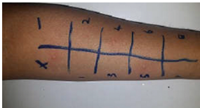
Figure 2: Allergy skin prick test for aeroallergens with histamine and saline controls.

Nasal challenges to an allergen or nasal cytology are tests that are limited to research and not routinely used in clinical settings.