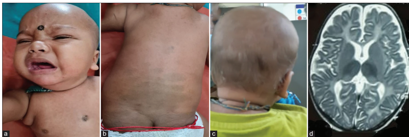
Figure 1: The dysmorphic features are coarse facial features (a), Mongolian spots (b), sparse hypopigmented hair (c), and an magnetic resonance imaging of the brain showing hypomyelination with T2-weighted bilateral hypointensity of the thalamus (d).

Theoretically, lysosomal storage disorders can have deficient vitamin B12 as the B12 metabolism requires lysosomes as previously described. A 2-year prospective study on patients with Gaucher disease type 1 (GD) on enzyme replacement treatment (ERT) with and without polyneuropathy showed elevated homocysteine and methylmalonic acid in the polyneuropathy group, but both groups showed low-normal vitamin B12 values. This study shows an association between GD and vitamin B12 deficiency. [9] However, the clinical translation awaits further studies. Another study that examined the overall vitamin B12 metabolism status in GD skin fibroblasts versus control showed preserved metabolism of B12 despite the lysosomal storage of glucocerebroside. The study concluded that the presence of a deficiency of vitamin B12 in GD patients requires an individual case-based approach. The study however did not study B12 metabolism in other cell types and needs further studies. [10] However, no reports exist on linking GM1 gangliosidosis to vitamin B12 defect.