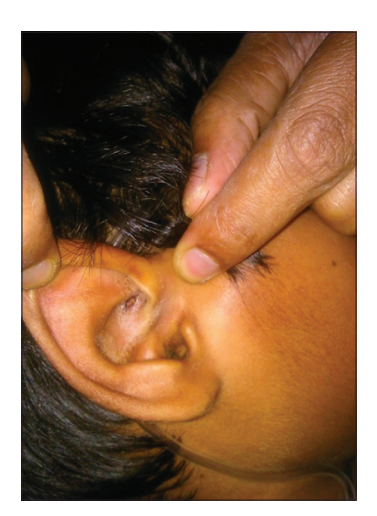
Figure 2: An eschar inside R pinna.

fever subsided only after 5 days. Finally, 3 patients (10.7%) died, including one patient treated with doxycycline.<sup>[4]</sup>